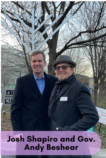
Josh Shapiro and Gov. Andy Beshear

Thank you to the 2022 members of the JFB Board of Directors for their commitment to our mission and for working alongside the staff and numerous volunteers to unite, empower, and improve our Jewish community.