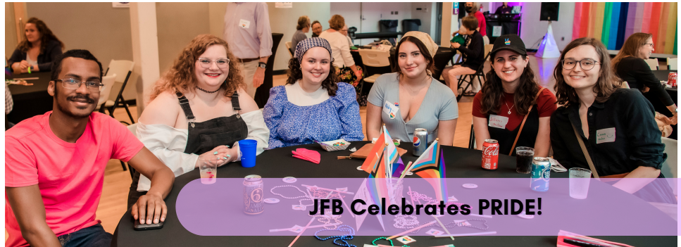
JFB Celebrates PRIDE!

In June, JFB's Young Bluegrass Jews group organized our first ever PRIDE celebration to show support for the LGBTQ+ community. Nearly 120 Jewish and non-Jewish community members were in attendance. They enjoyed delicious cupcakes, candy, and specialty cocktails, as well as an exciting drag performance with 5 local queens participating. With support from the performers who donated part of the tips they earned, as well as the generosity of over 25 sponsors, the event raised $3,000 which was donated to local youth shelter Arbor Youth Services.