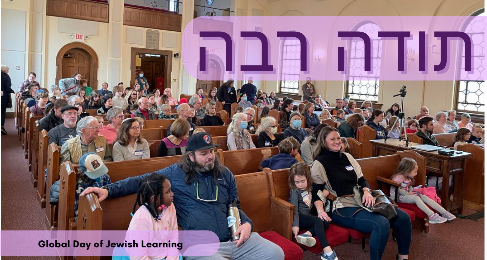
Global Day of Jewish Learning

Now and always, we are so thankful for YOU, Jewish Lexington. Every time you attend one of our events or volunteer on a committee, you inspire us to do even more for our community. Every dollar you give goes toward valuable experiences, programs, and events enjoyed by Jews of all ages. In every hug, every high five, and yes, even every Facebook "like," we see the love and passion you have for Jewish Lexington, motivating us to strengthen Jewish Federation of the Bluegrass even more to support the community we adore so much. In times of joy and even in times of sadness, when we find ourselves coming together, we know we can go the distance. It's all because of the generosity, the support, and the kindness of our friends and neighbors. We're proud to be part of Jewish Lexington, and we hope you are, too! Thank you!