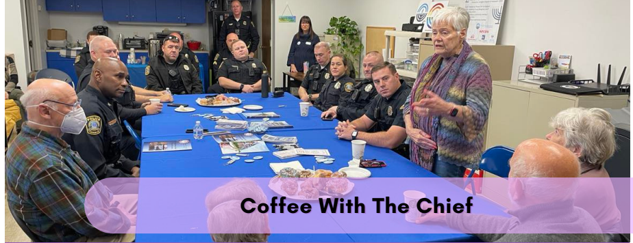
Coffee With The Chief