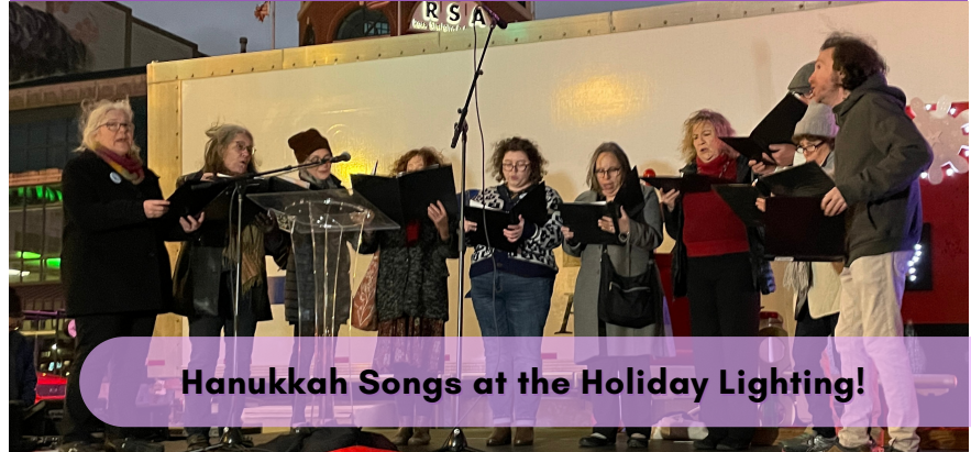
Hanukkah Songs at the Holiday Lighting!

Based on the momentum from 2021, we officially joined Downtown Lexington Partnership as a part of the annual holiday lighting program in Triangle Park. We worked with Jewish community leadership to incorporate a joint community choir singing festive Hanukkah songs, and coordinated our Hanukkah celebrations downtown throughout the Festival of Lights.