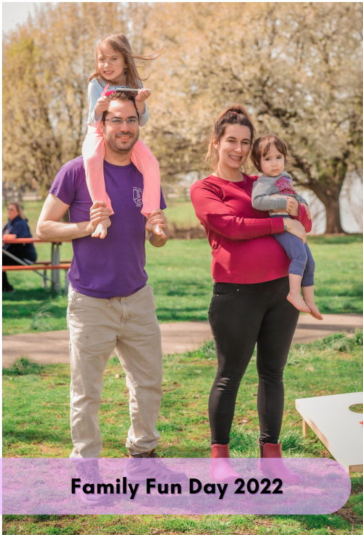
Family Fun Day 2022

We are PROUD to work with our community partners!