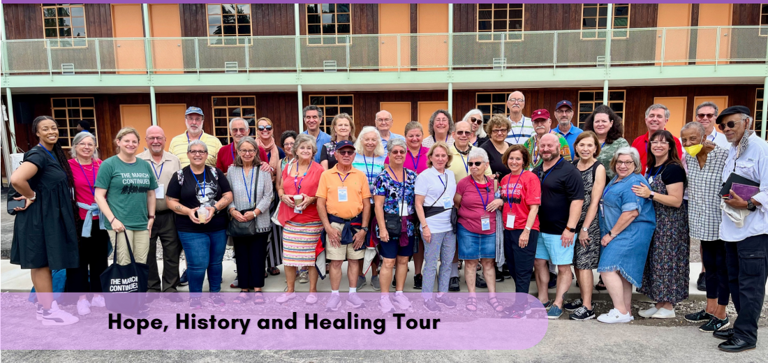
Hope, History and Healing Tour